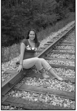
3 NO! too far away and difficult