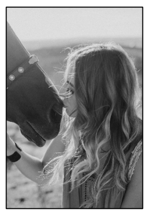
1 NO! has a prop, and you can't see her face

We will request a replacement photo if yours does not meet these guidelines, OR we will use your ASB card photo instead